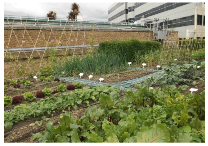
The roof-top vegetable garden at Normura International

As a contrast to the historic gardens and way above the city streets is the garden on the 6th floor roof terrace of Nomura International. This modern garden, with stunning views across and down the river, is maintained by its planners but volunteer employees have created a spotless vegetable garden along the edge by Canon Street Station. No doubt an enterprising snail will reach it one day.