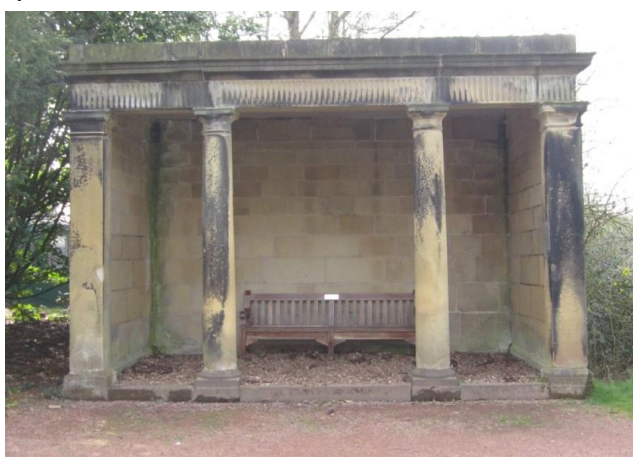
Norton Priory summerhouse

The 18th century summerhouse at Norton Priory, said to be by James Wyatt, is a simple and classic example of a loggia. Located south of the former hall, it terminated a formal walk between the pleasure grounds and Big Wood. Though the Hall and much of the layout of the grounds have been lost, this building survives as a reminder of more gracious times and aspirations.