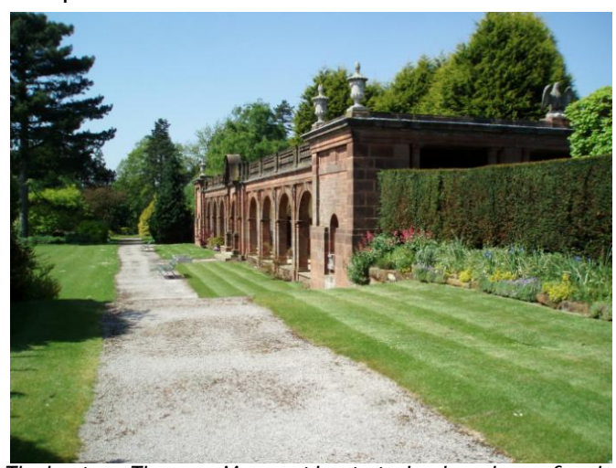
The loggia at Thornton Manor with principal red sandstone facade facing south west beside one of the main walks in the garden

The gardens of Thornton Manor on the Wirral, the former home of Viscount Leverhulme, were laid out predominantly between 1905 and 1914. Their design was the result of collaboration between Thomas Mawson and Leverhulme. Colonnaded garden loggias serve as focal points in the garden, buildings which were designed to enable views out as well as being focal points themselves.