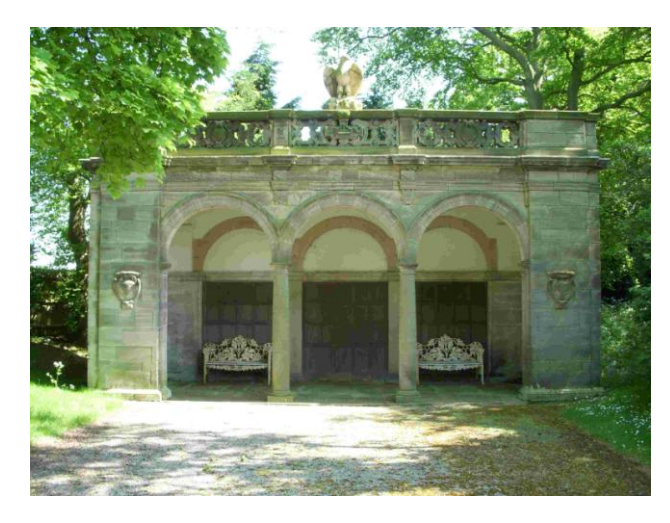
The Tea House at Thornton Manor, in effect a smaller loggia, which terminates the south eastern end of the main terrace