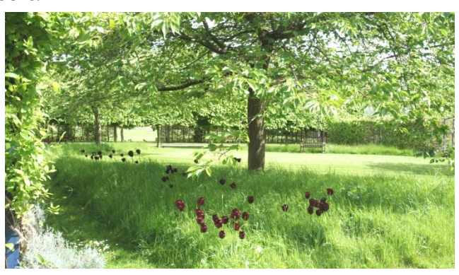
Above: the Square garden with tulips in flower

It is entered from the holiday cottage stable block through a pleached hornbeam hedge with arches leading, on the right to a large open space with beech and lavender hedging and a south facing Mediterranean border. To the left an arch leads first to the Circular garden with herbaceous borders in blue white and silver. The Square garden was created as a seating area for guests and it is at its best when spring bulbs are in flower. The Triangular garden features rose beds.