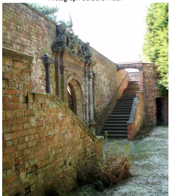
Thornton Manor: The rear elevation of the loggia with flights of stairs onto the roof and a central doorway leading to the kitchen garden