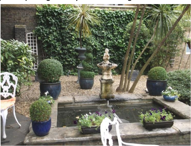
The garden at the Academy Hotel

Another private space, or spaces, were the two small, secluded, courtyard gardens of The Academy Hotel. In one it was possible to enjoy wine or coffee by a pool, a privilege usually reserved for guests.