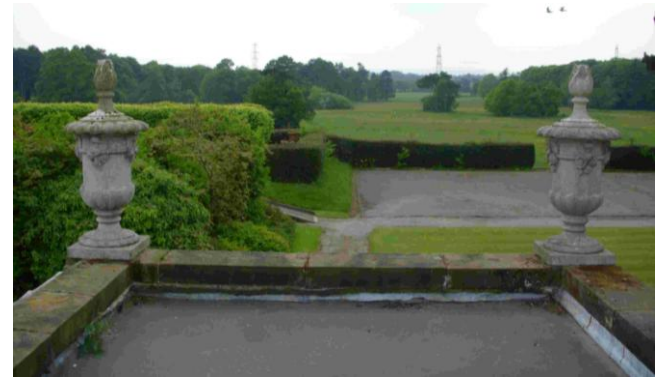
Thornton Manor: View south west from the roof over the garden and parkland towards the Dee estuary and north Wales